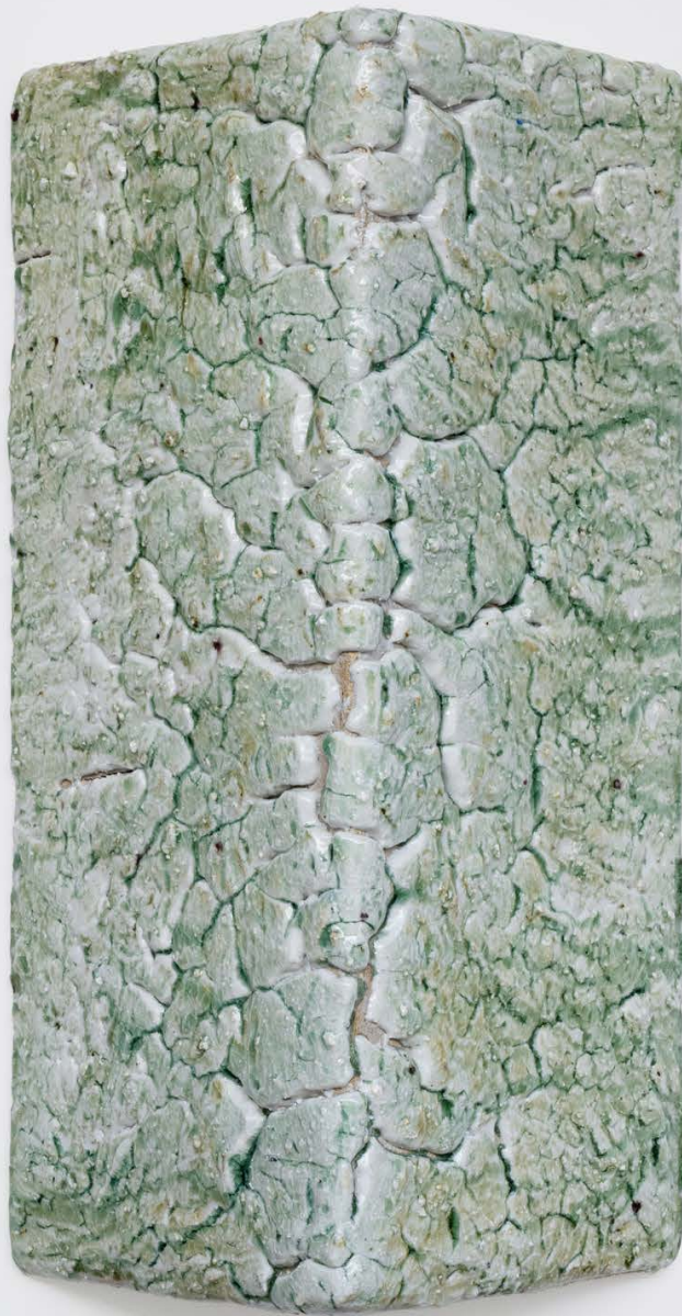
TRUSS 01 Claudia Lau 2022 Stoneware, Ararat fireclay shino glaze, wood ash glaze, stainless steel 73(h) x 41(w) x 21(d) cm $8, 500