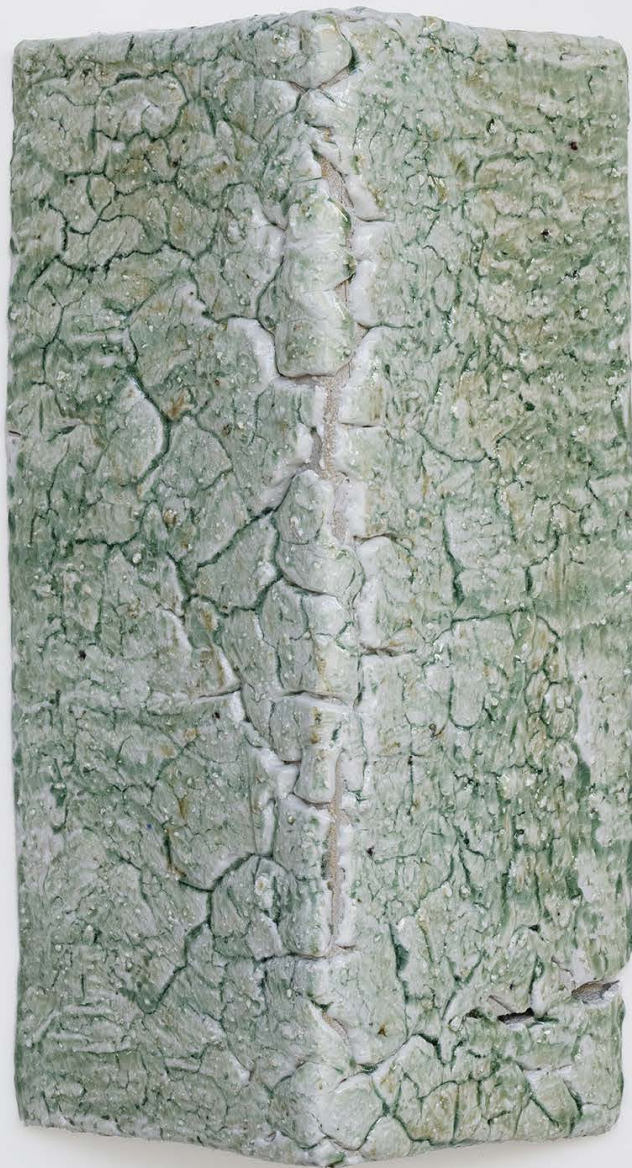
TRUSS 02 Claudia Lau 2022 Stoneware, Ararat fireclay shino glaze, wood ash glaze, stainless steel 73(h) x 41(w) x 21(d) cm $8, 500