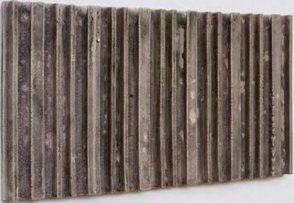
SCREEN 01 Claudia Lau 2022 Oyster shell alumina glaze, copper glaze, wood ash glaze, stainless steel 33 x 65 x 4 cm $2,800