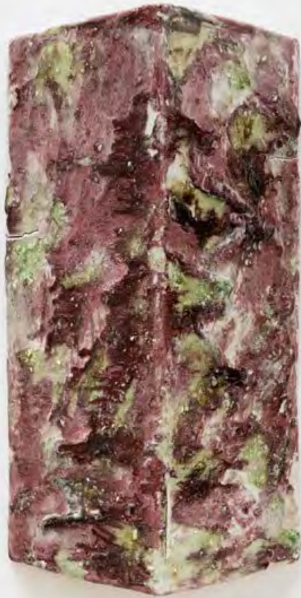
TRUSS 03 Claudia Lau 2022 Stoneware, shino glaze, wood ash glaze, copper glaze, feldspar chips, fireclay stones, stainless steel 75 x 41 x 21 cm $8,500