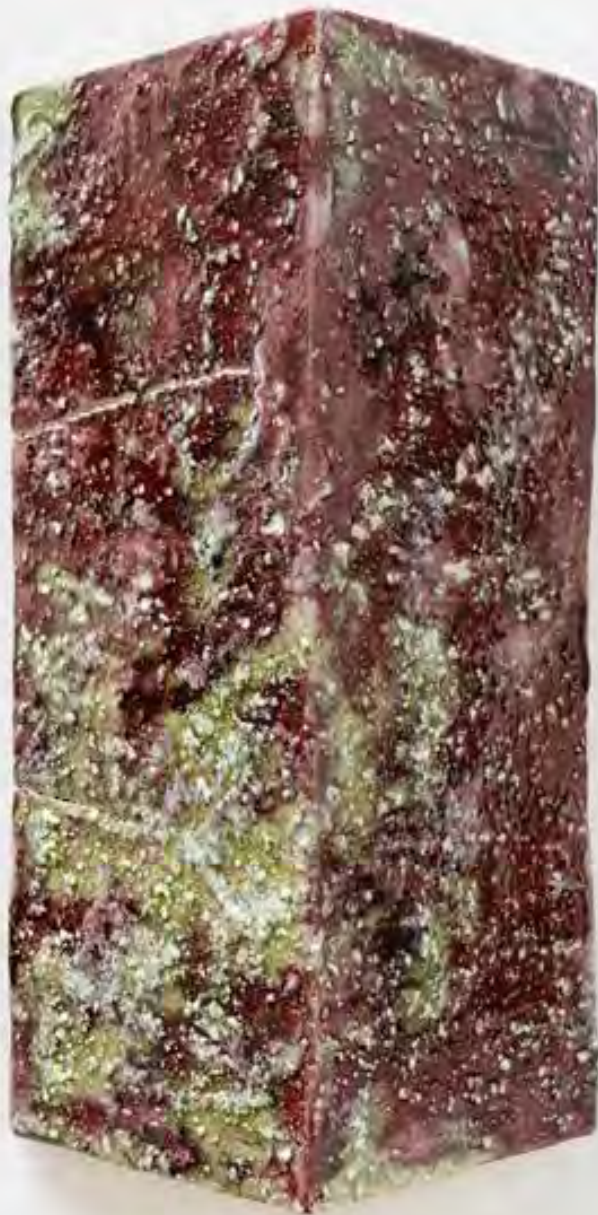
TRUSS 05 Claudia Lau 2022 Stoneware, shino glaze, wood ash glaze, copper glaze, feldspar chips, fireclay stones, stainless steel 77 x 41 x 21 cm $8,500