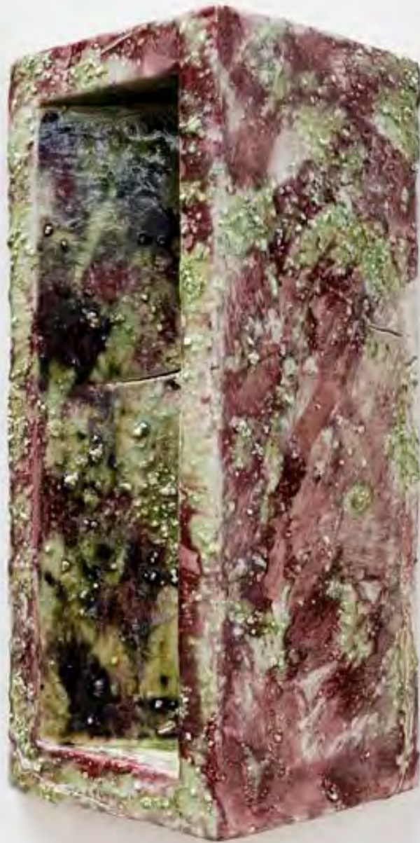
TRUSS 04 Claudia Lau 2022 Stoneware, shino glaze, wood ash glaze, copper glaze, feldspar chips, fireclay stones, stainless steel 76 x 41 x 21 cm $8,500