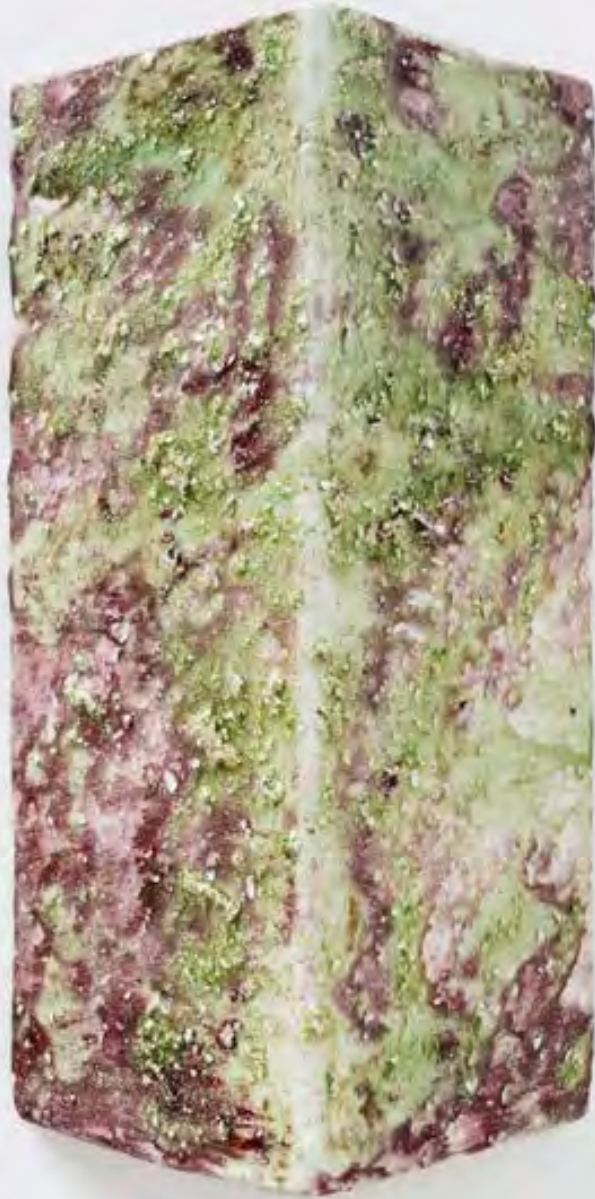
TRUSS 06 Claudia Lau 2022 Stoneware, shino glaze, wood ash glaze, copper glaze, feldspar chips, fireclay stones, stainless steel 78 x 41 x 21 cm $8, 500