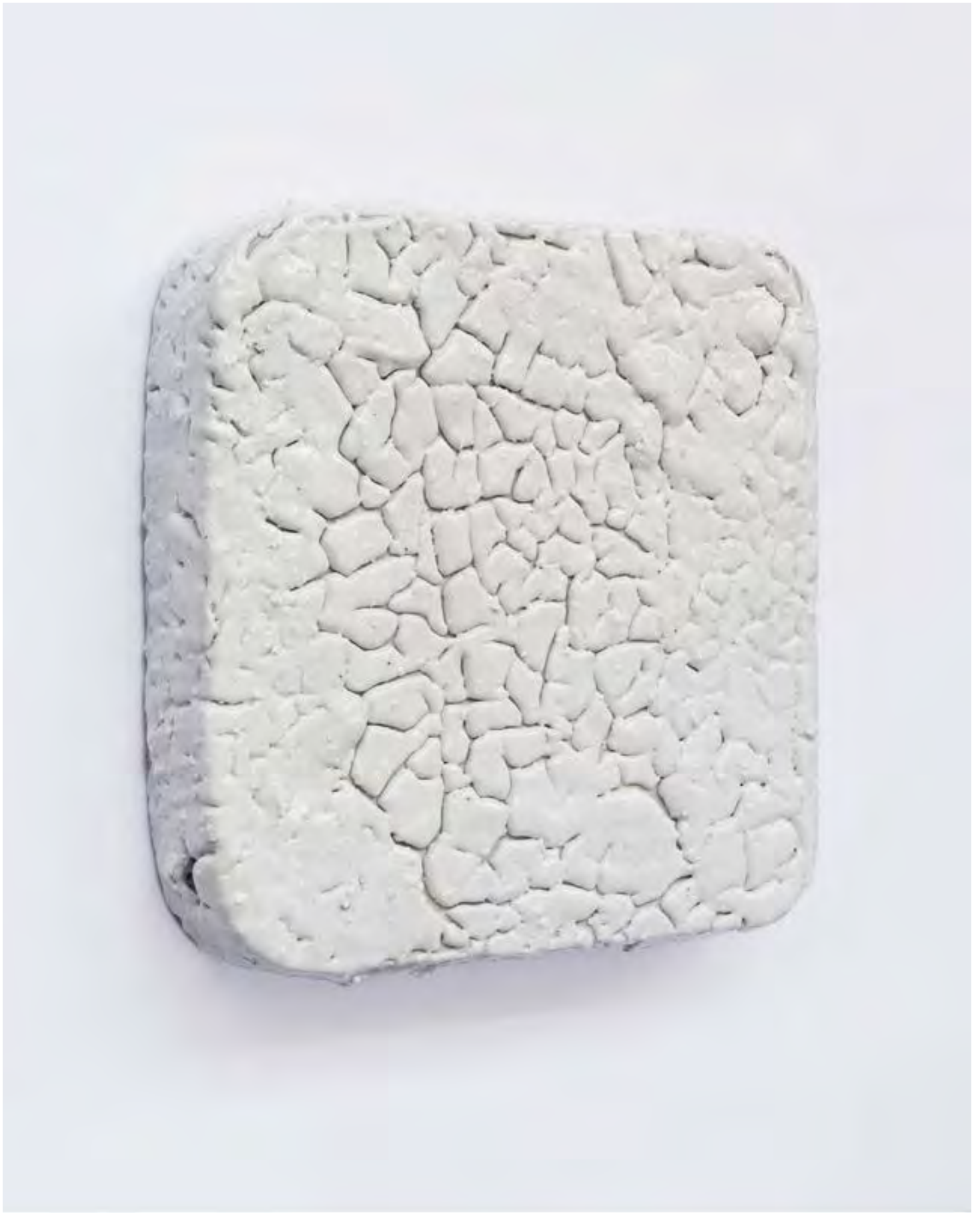
RIFT 02 Claudia Lau 2022 Stoneware, Ararat fireclay feldspar glaze, stainless steel 38 x 37 x 8 cm $2, 000 SOLD