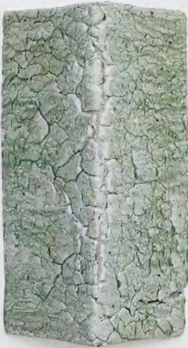
TRUSS 01 Claudia Lau 2022 Stoneware, Ararat fireclay feldspar glaze, wood ash glaze, stainless steel 73 x 41 x 21 cm $8,500