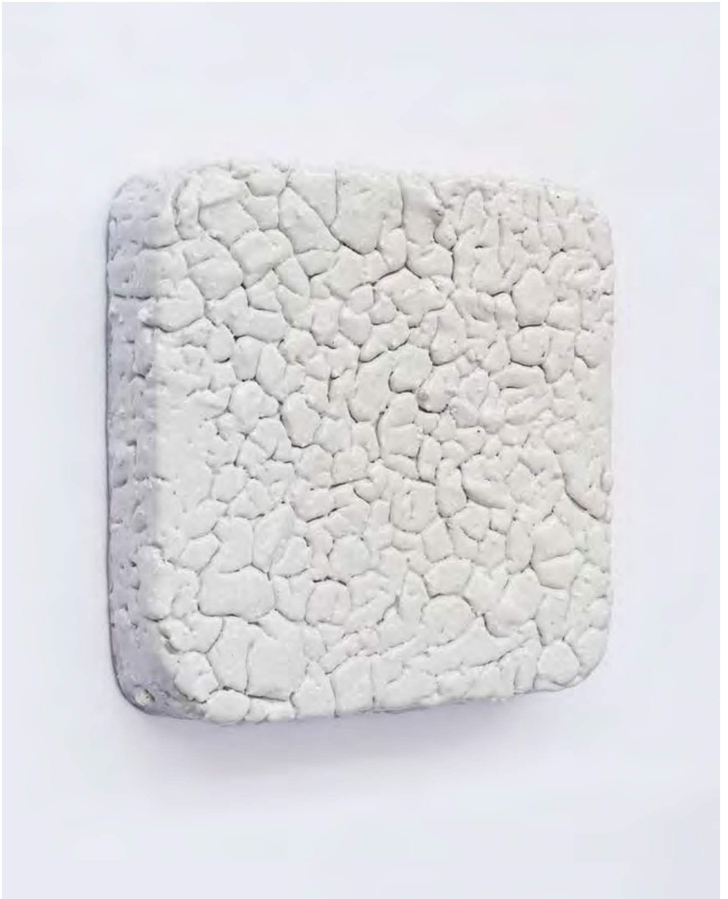
RIFT 01 Claudia Lau 2022 Stoneware, Ararat fireclay feldspar glaze, stainless steel 37 x 37 x 8 cm $2,000