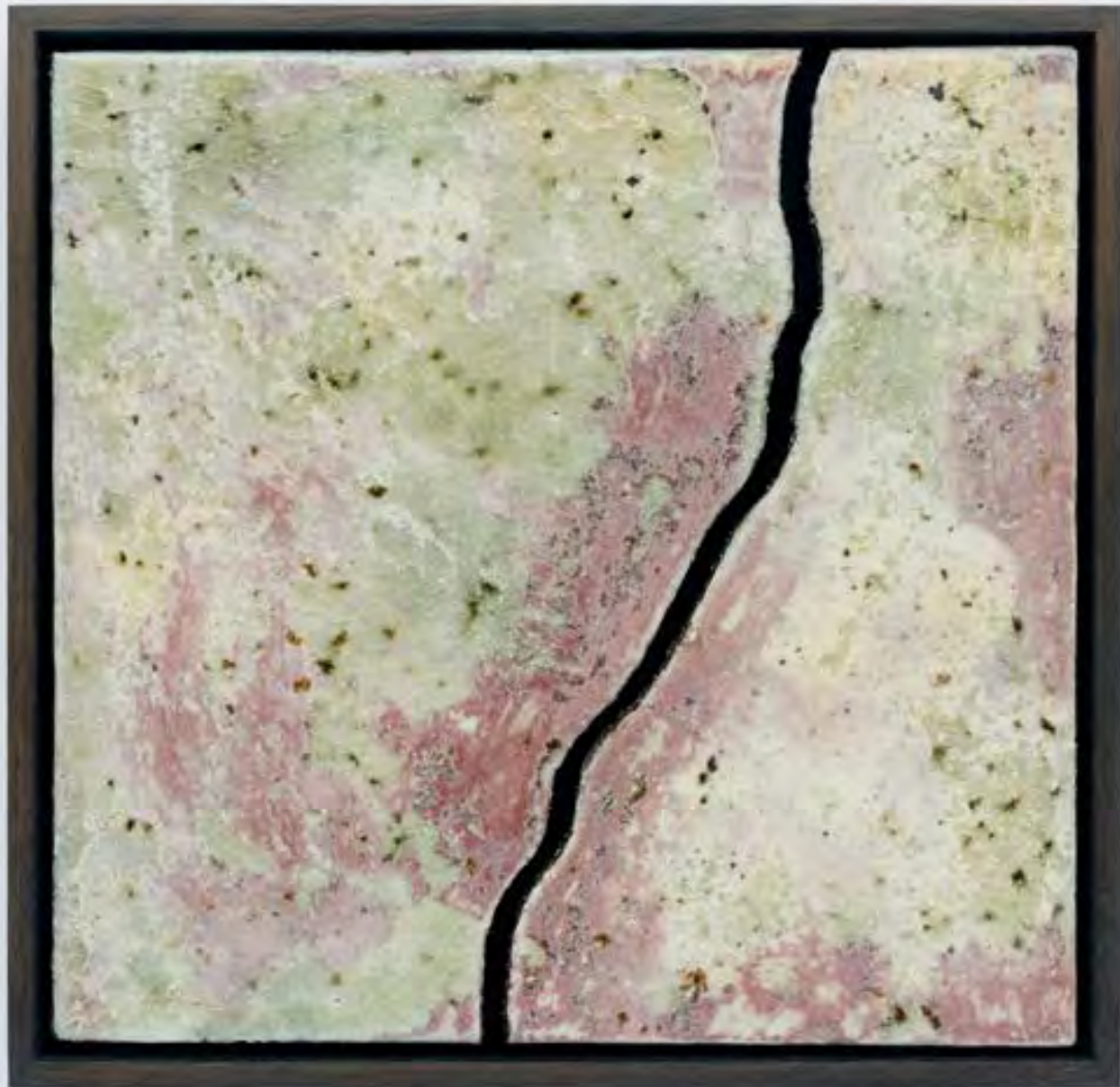
ROAD Claudia Lau 2022 Stoneware, porcelain slip, feldspar glaze, wood ash glaze, copper glaze, Victorian ash timber, steel 29.5 x 29 x 5.5 cm $1,320 SOLD